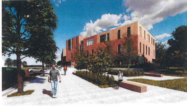
WEST VIEW FROM RIVERSIDE DRIVE