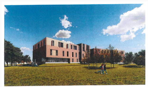
EAST VIEW FROM ETHEL TUCKER PARK