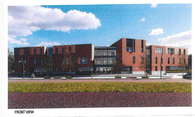
Okotoks Arts and Learning Campus